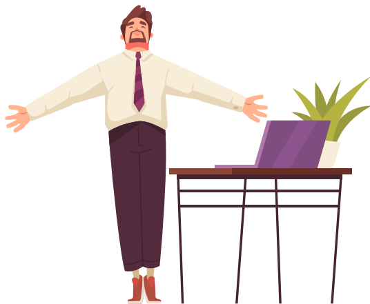
The code works