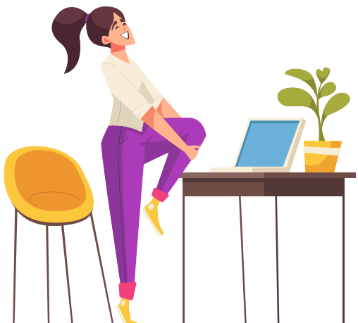
Kicked at the table out of anger