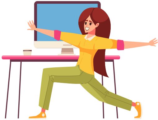
With big steps to work