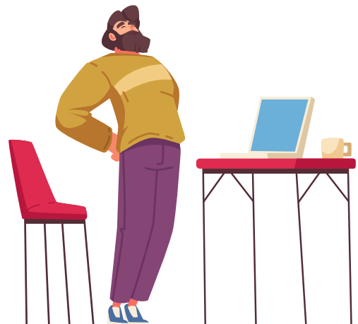
Lunch time is calling